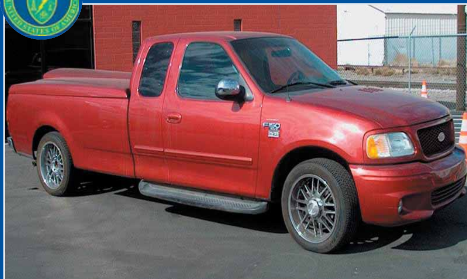
2005 Hydrogen ICE 1 Truck