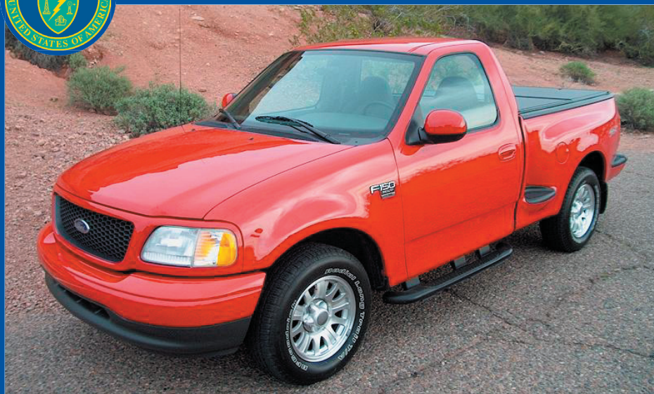
2003 Hydrogen ICE 1 Truck